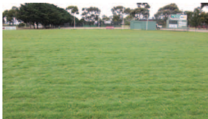
Seven weeks after planting