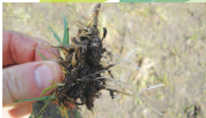
Rootzone two weeks after planting